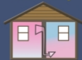
Ceiling to Floor