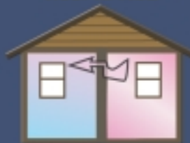
Ceiling to Ceiling