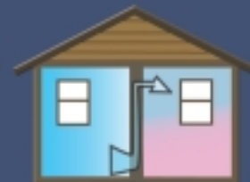
Floor to Ceiling