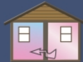
Floor to Floor

Pull cool air from floor level or warm air from ceiling level and distribute high or low