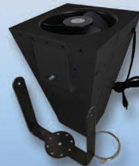
Black Model DSF2B