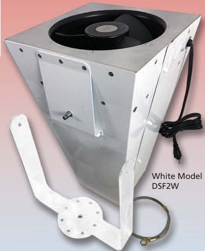
White Model DSF2W

D-STRAT 30 watt, 540 CFM high velocity fans can reduce this differential by 50% or more, shortening thermostat cycles and making occupants more comfortable.