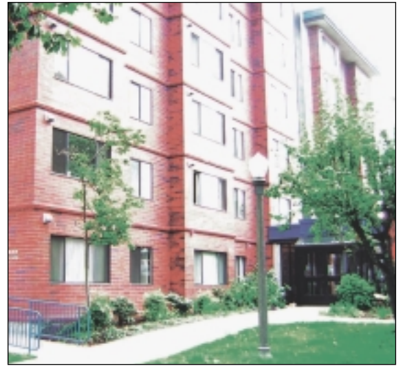
The E. B. Wilson apartment building had its venting system for boilers rerouted from sidewall to roof to eliminate exhaust fumes entering apartments making them unlivable.

After remodeling the five story E. B. Wilson apartment building in Tacoma, Washington, the Tacoma Housing Authority faced a major problem. Flue gases from two new boilers, installed during the renovation, were being direct vented out the side wall and sucked into six adjacent apartment units through windows and a ventilation system. The apartments were unlivable and unrentable. The Authority's engineers came up with a solution: reroute the venting vertically within the five-story building, through the roof and use a variable-speed mechanical exhaust fan at the termination.