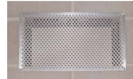
Morning Star Pattern

1601 Ninth Street • White Bear Lake, MN 55110-6794 PHONE (800) 255-4208 • (651) 426-2993 • FAX (651) 426-9547 Visit our web site • www.tjernlund.com